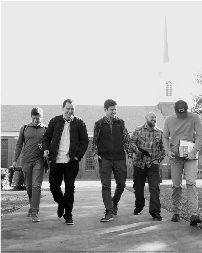
BUF students leaving the R.G. Lee Chapel and headed to class.

An intensive evaluation of a student's learning in graduate studies. The course will consist of a major research project based on an area of music and worship. The course will culminate in the successful defense of the student's thesis before a graduate committee. Three semester hours credit.