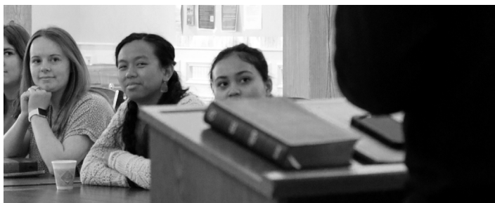
BUF students are equipped with knowledge grounded on the truths of God's Word.

NOTE: FOR INFORMATION ABOUT STUDENT HOUSING, SEE THE STUDENT LIFE SECTION OF THIS CATALOG.